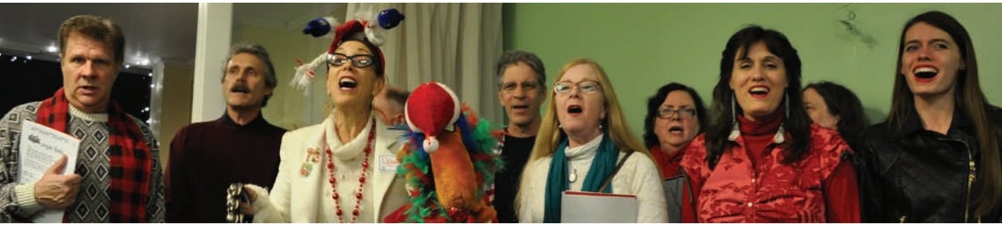
The National In-Choir provided musical cheer for all our guests!