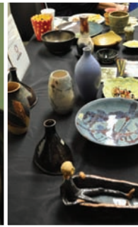
Handcrafted ceramics donated by the Village Arts Project were on sale at our Fundraising Bazaar