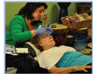
Nothing relaxes you like a facial!